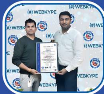
Webkype Info Services Private Limited