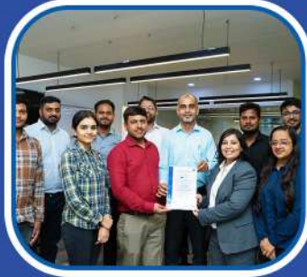
WPG Technologies Pvt. Ltd.