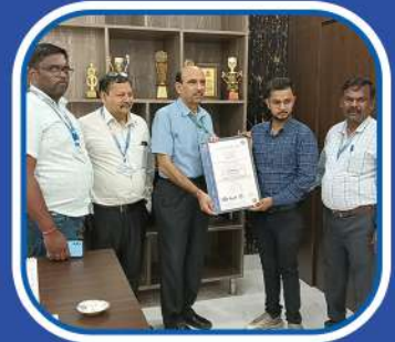
M/s Saraswathi Institute of Medical Sciences