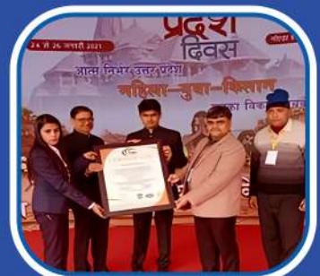
Govt. CDO Office