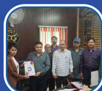
DRDA Govt. Office