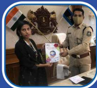
Govt. Sabarkantha SP Office