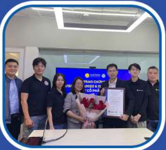
Sunteco Joint Stock Company