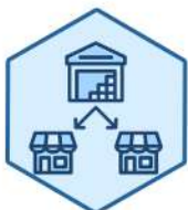
Wholesale & retail