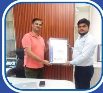
ADDON SHAREWARE PVT. LTD.