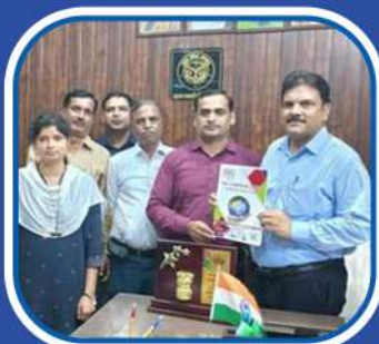
Govt. Chakbandi Office, Bareilly