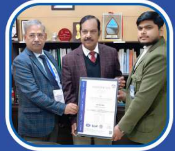
Central Board Of Irrigation & Power