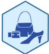
Leather product Industry