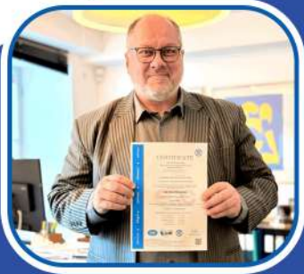
Zafehouze Solutions ApS