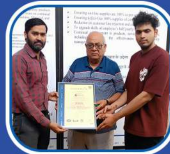
Hindon Forge Pvt. Ltd.