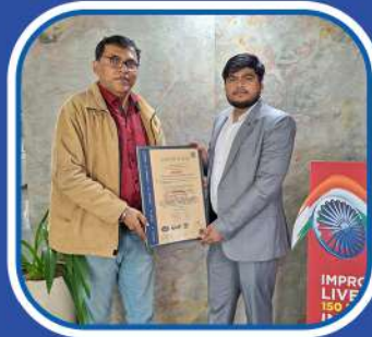
Intex Technologies India Limited