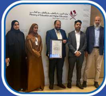
Ministry of Education and Higher Education