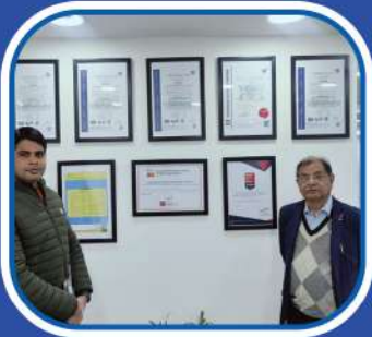
IntelliSmart Infrastructure Private Limited