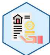
Real estate; Renting